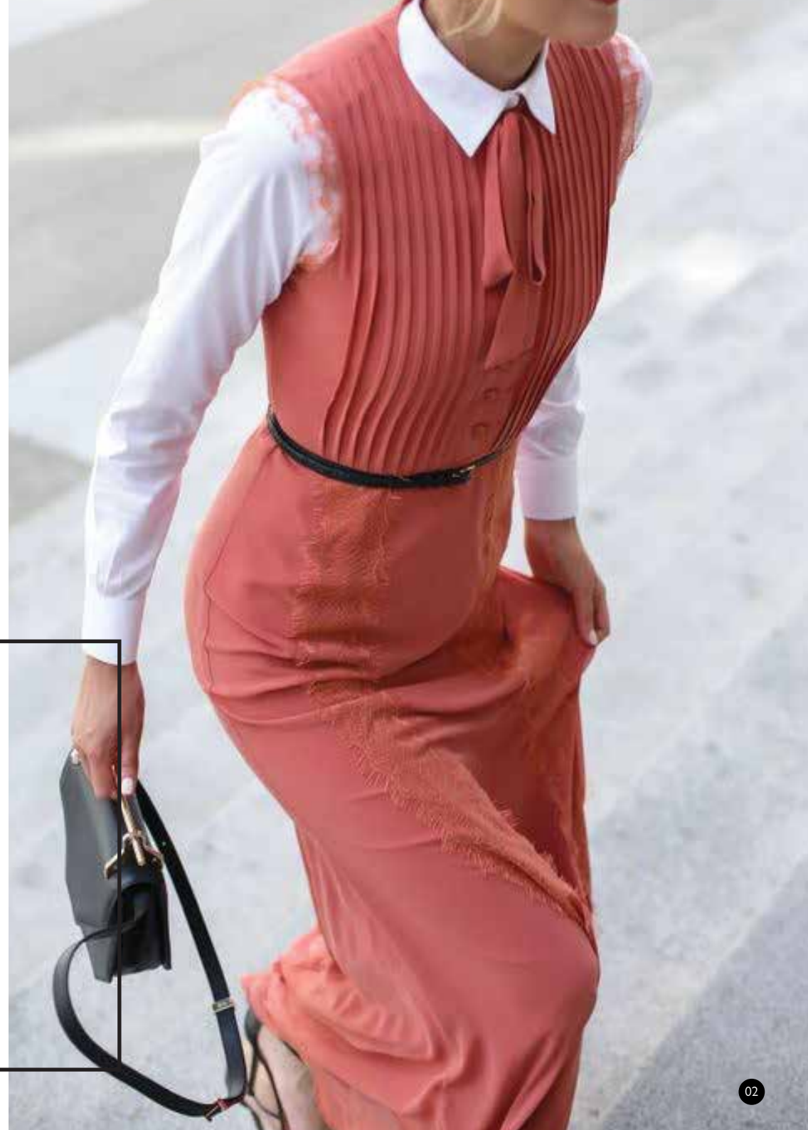
Image consultancy is one of the few professions offering more and more individuals the chance of earning a professional income both at a young age, as well as past the standard age of retirement. In fact, the majority of your clients might even fall in more or less the same age group as you, simply because people seem to relax and relate better with their peers the older they become.