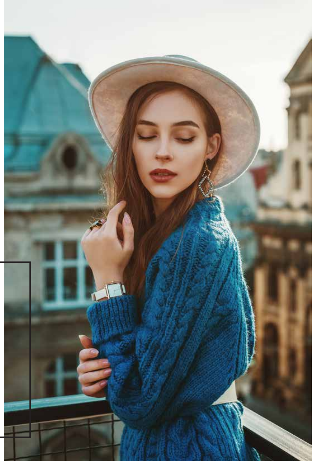
Image consultancy is one of the few professions offering more and more individuals the chance of earning a professional income both at a young age, as well as past the standard age of retirement. In fact, the majority of your clients might even fall in more or less the same age group as you, simply because people seem to relax and relate better with their peers the older they become.